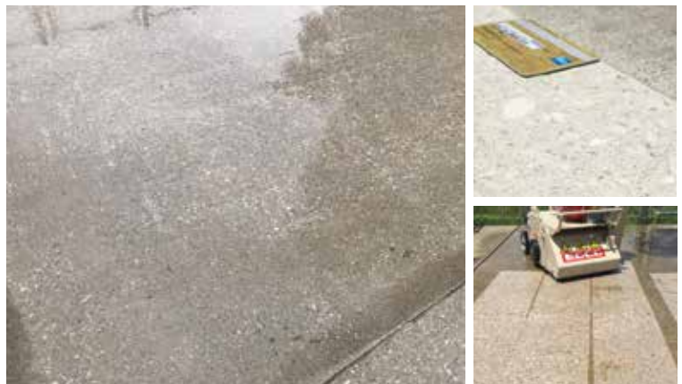
Dynatech's Flat Cutterz give a SMOOTH flat beautiful finish.