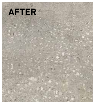
Smooth, bare aggregate