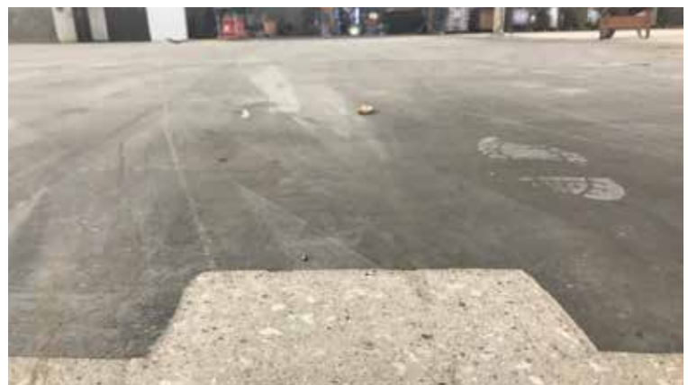
One pass! Thick epoxy removal!