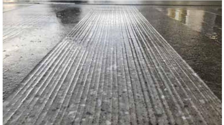
Dynatech's Rounds give you a corduroy footprint.